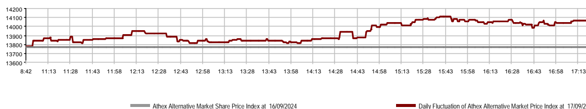
Daily Fluctuation of Athex Alternative Market Price Index