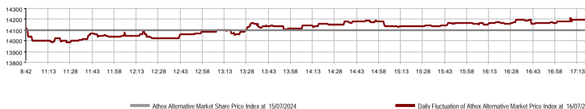
Daily Fluctuation of Athex Alternative Market Price Index