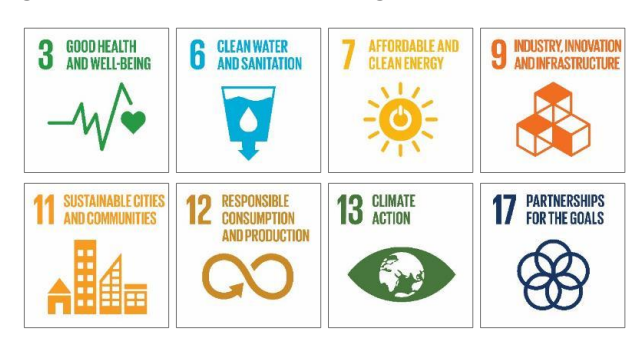
Goals associated with ICMA categories

The net Proceeds related to the Green Bond will directly and indirectly contribute to the enhancement of the sustainability and resilience of our Assets Portfolio. In this context, the SDGs directly related to the Green Bond Proceeds according to ICMA correspond to approximately eight out of the seventeen Targets in total: