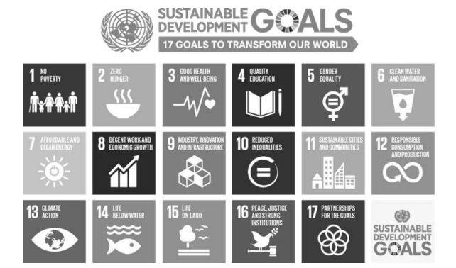
U.N. Sustainable Development Goals